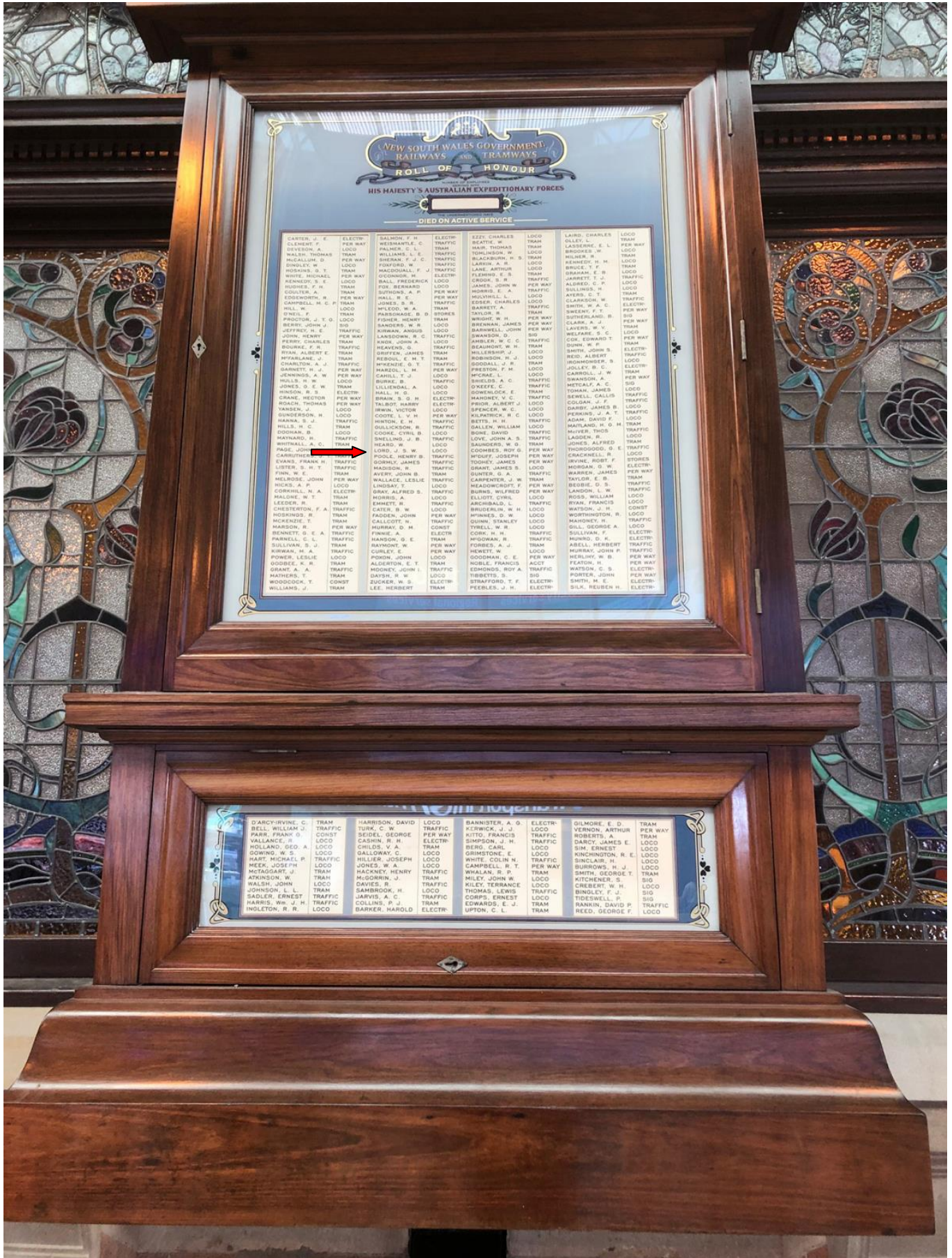
NSW Government Railways & Tramways Roll of Honour