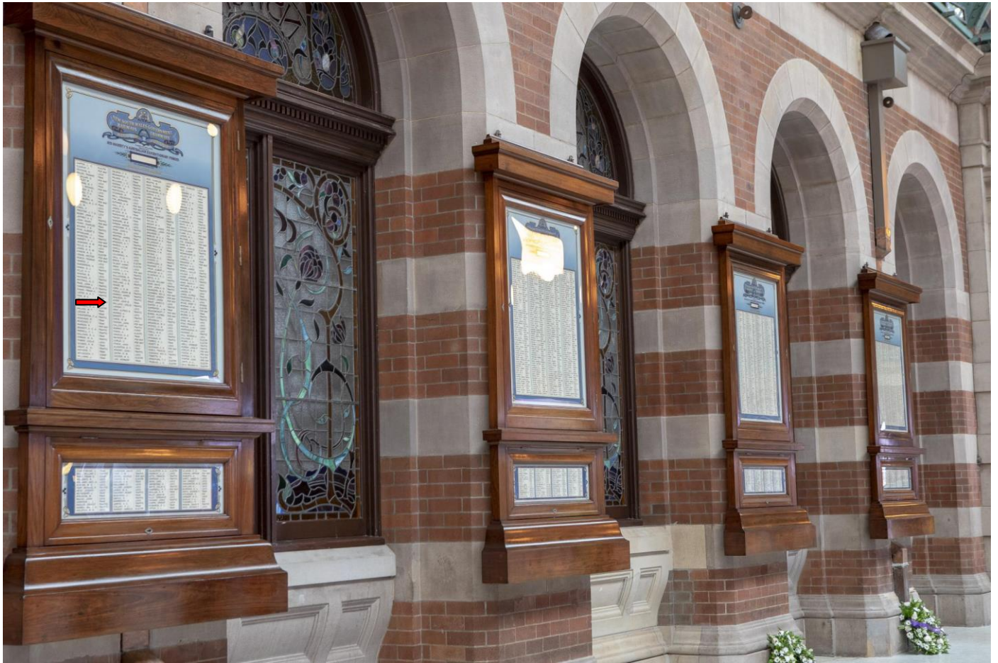
NSW Government Railways & Tramways Roll of Honour