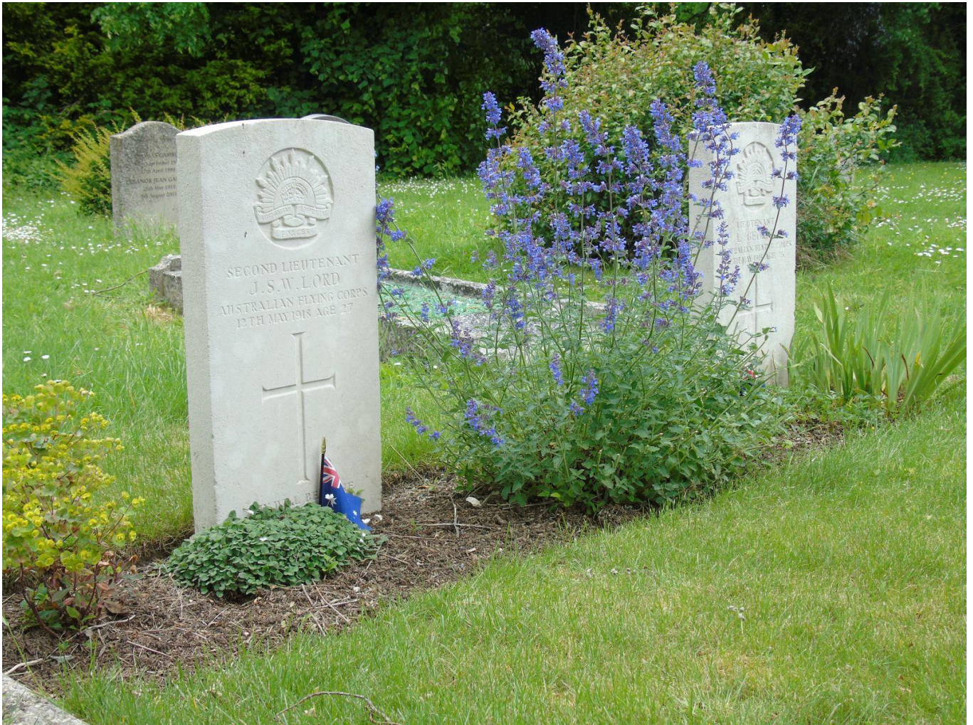
Photo of the 2 Australian Flying Corps Headstones – 2nd Lieut. Lord (left) & Lieut. George (right)